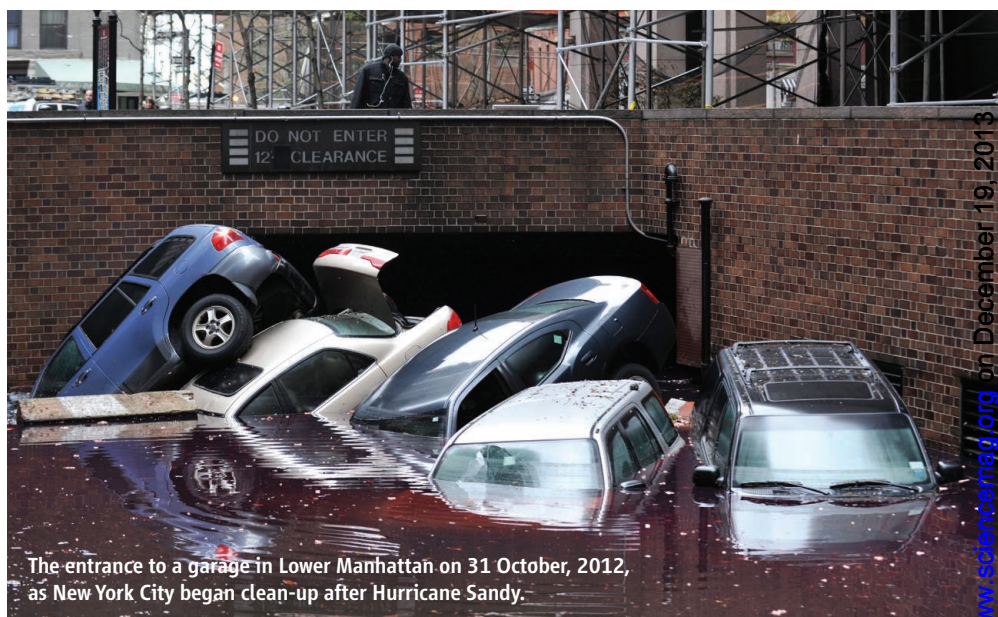
The entrance to a garage in Lower Manhattan on 31 October, 2012, as New York City began clean-up after Hurricane Sandy.

There are serious science gaps, however (5, 6). In many communities, decision-makers lack climate information or the means to apply it. In others, knowledge of current or potential future impacts exists, but not in a form or context that decision-makers can assimilate or act on in advance. In still