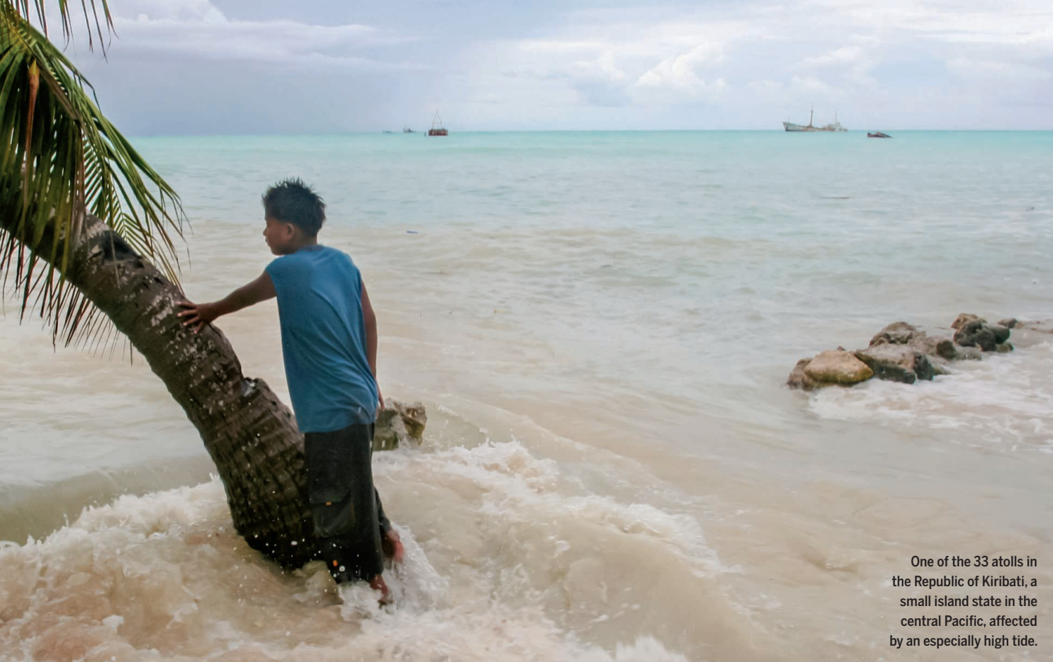
One of the 33 atolls in the Republic of Kiribati, a small island state in the central Pacific, affected by an especially high tide.

erable is strongly determined by social, cultural, and economic determinants and often requires joint subjective and expert deliberation before being submitted to allocating responsibilities. Risk analysis has developed analytical procedures for negotiating and segregating risk according to risk preference (“risk layering”) that have been used in the insurance industry and are being applied to climate risk issues to help allocate risks to multiple actors at various scales (17).